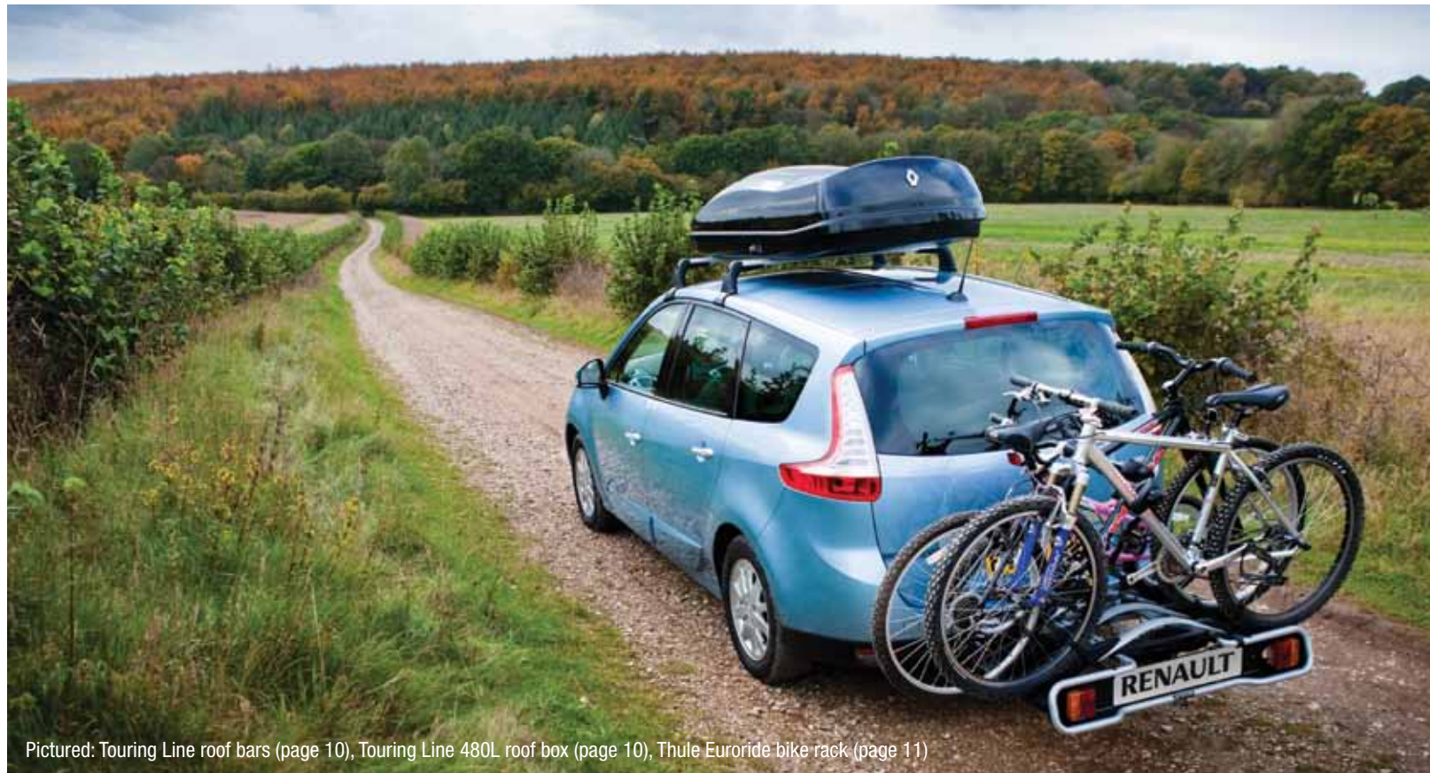
Pictured: Touring Line roof bars (page 10), Touring Line 480L roof box (page 10), Thule Euroride bike rack (page 11)